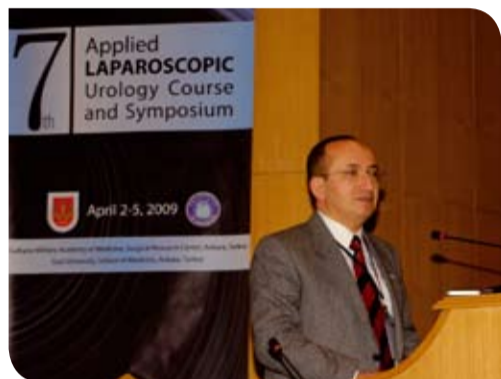
Prof. Y. Özgök (Turkey), president of the Applied Laparoscopic Urology Course and Symposiums

Overall, each course is a 4-day intensive graduate training programme comprising of real dry-lab application of laparoscopic instruments, hands-on-training, developing stereotactic abilities, and real wet-lab training on porcine tissue in a stress free learning environment. There are 4 major structural components: