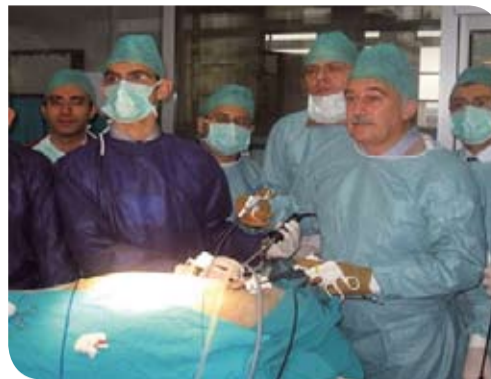
Prof. J. Rassweiler (Germany) tutoring how to perform live laparoscopic nephrectomy in the animal research lab on a pig at a past symposium

The number of participants is limited to 36 urologists for each course. Since 2005, we have provided laparoscopic urology courses to more than 250 urology specialists in Turkey. Beyond the Turkish trainees, we have provided laparoscopy training to colleagues from other countries such as Germany, Greece, Bulgaria, Uzbekistan and Azerbaijan.